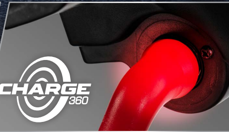
Magnetic charging with Charge360 technology