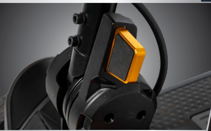
Angle-adjustable tiller mechanism