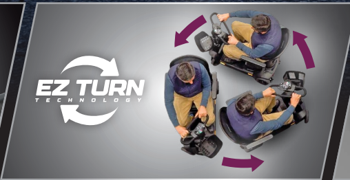
Featuring Pride's patented EZ Turn Technology